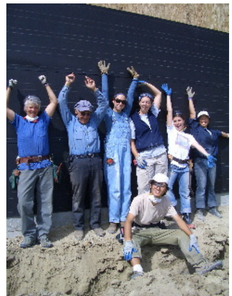
Lopez Island Interns